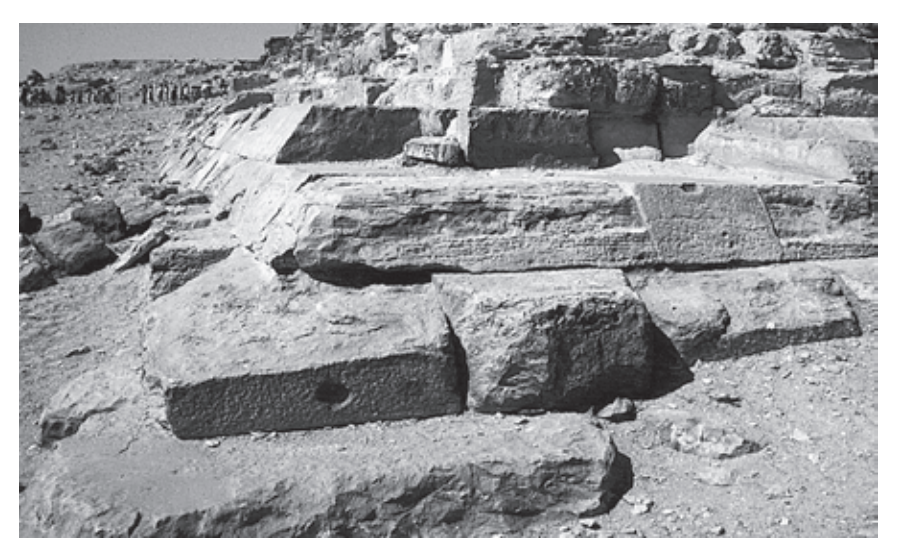
8. The south-east corner of pyramid G I-c.