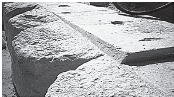
5. The south side of pyramid G I-d.