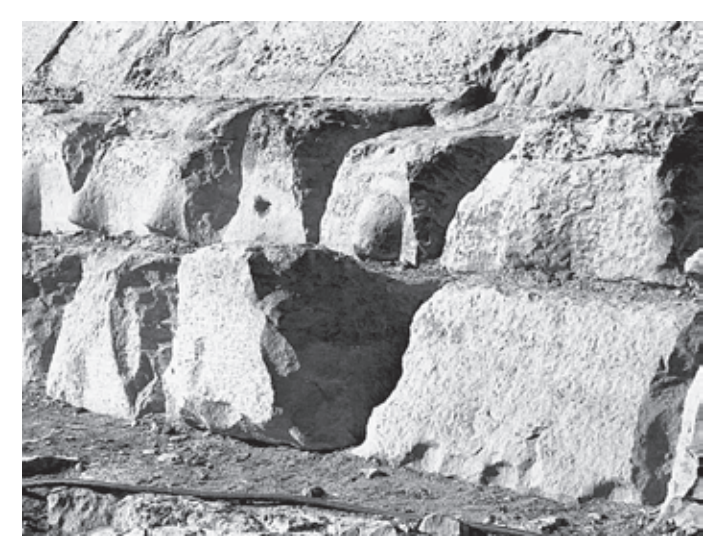
1. The south side of pyramid G I-c.