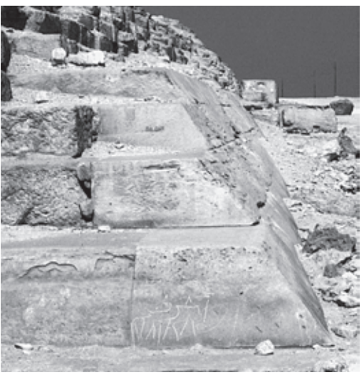
2. The south-east corner of pyramid G I-b.