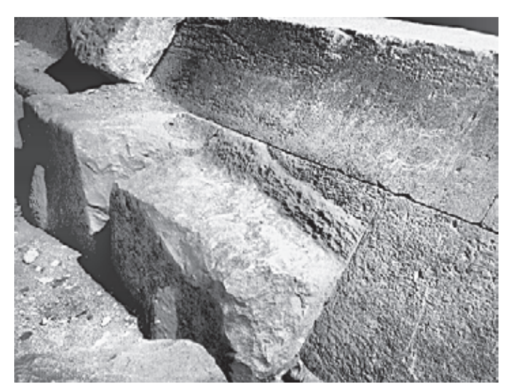
3. The north-east corner of pyramid G I-c.