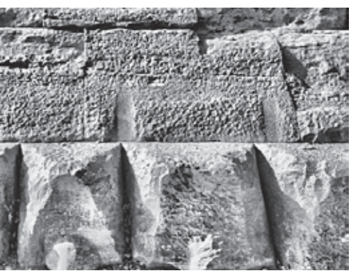
i. The south side of pyramid G I-c.