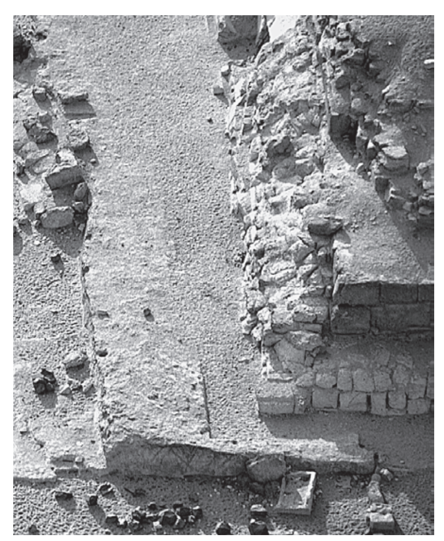
7. The north-west corner of pyramid G I-a.