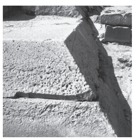
1. The west side of pyramid G I-c.